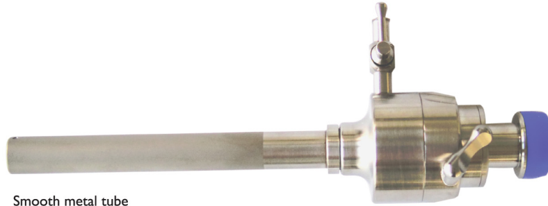
Smooth metal tube

Trocar sleeve with separate opening lever with one fixed stopcock for insufflation