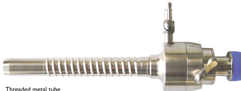
Threaded metal tube