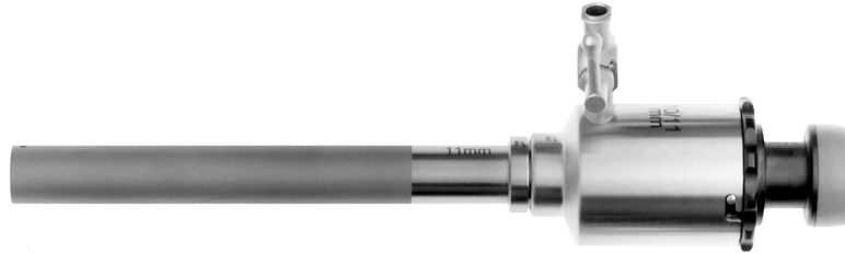
Smooth metal tube